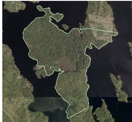
Aerial photo of Fernald's Neck Preserve

Or Click on "Become a Member" @ www.coastalmountains.org