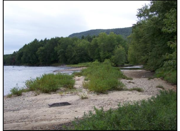
Pebble beach looking downriver. Hand carry path accesses to this beach.