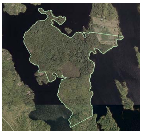
Aerial photo of Fernald's Neck Preserve

Or Click on "Become a Member" @ www.coastalmountains.org