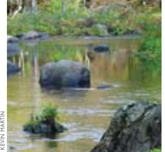
A quiet spot in West Epping.

between Blake Road and the Lamprey River Forest. ACCESS No public access – view from road only.