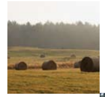
Bales of hay dot the landscape.

DIRECTIONS From Lee Center, proceed east on Lee Hook Road. The Farm is on the right.