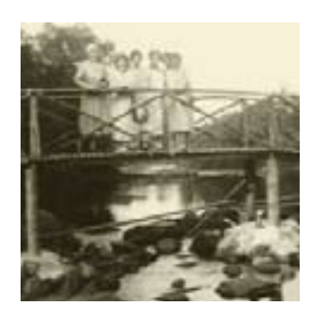
Visitors to Highland House.

ACCESS No public access – view from road only.