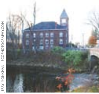
Epping Town Hall overlooking the river.

RECREATION Behind the Town Hall is Town land that has access to the river for canoeing (a short carry from the parking area to the river) and fishing.