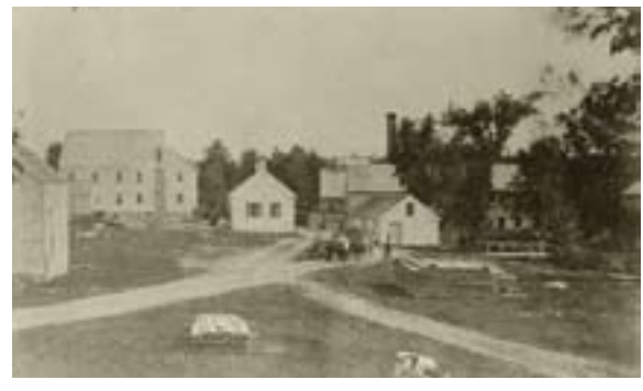
Mills at Wiswall Dam c. 1880