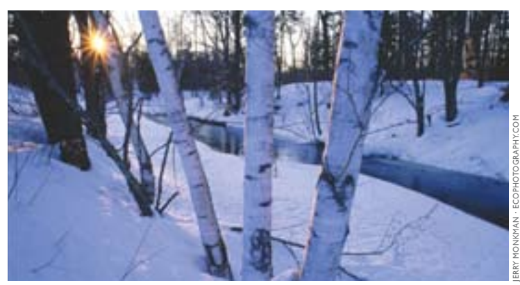
The Lamprey River is a source of enjoyment year-round.

ACCESS No public access – view from road only.