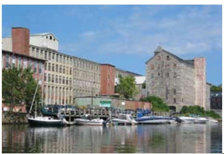
These mills in downtown Newmarket were once powered by the Lamprey River.

Newmarket was incorporated in 1727 and was called Lampreyville for a time. Textile mills were a prominent feature of Newmarket in the 1800s with dams built on the Lamprey to help the industries. Recently several buildings have been converted to apartments and business locations.