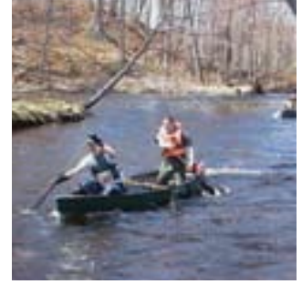
Lamprey River Canoe Race

This town was named after the Epping Forest in England because of its heavily forested land. Epping was founded in 1741 and is the only town to have given three Governors to New Hampshire. It is famous for its brickyards, as bricks made here were used in the construction of buildings and schools here and in nearby towns.