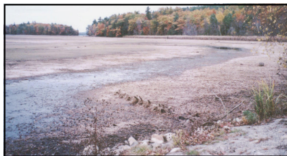
Wendy Dennis, Oct 23, 2001

Two hundred years ago, before dams were built at the Cobbossee outlet, the lake, streams, and islands looked very different from what we see today. Before the pond was dammed, early farmers harvested meadow hay along some parts of the shoreline.